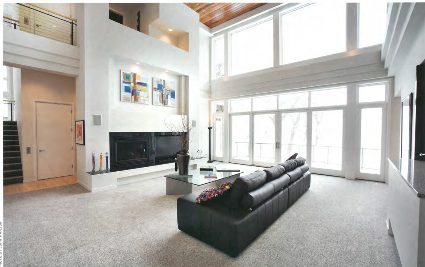
Great room — lake view