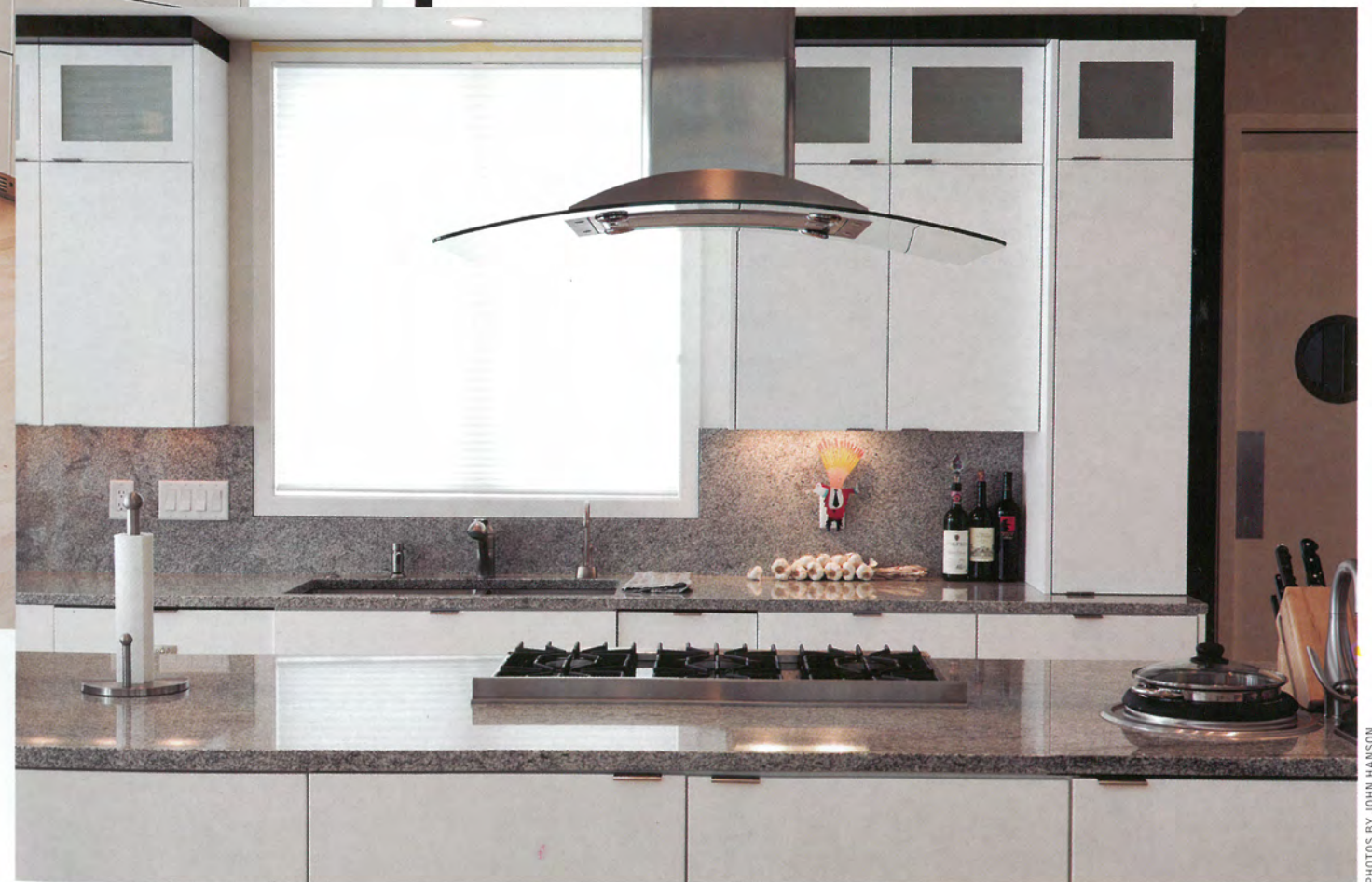
Kitchen view from great room