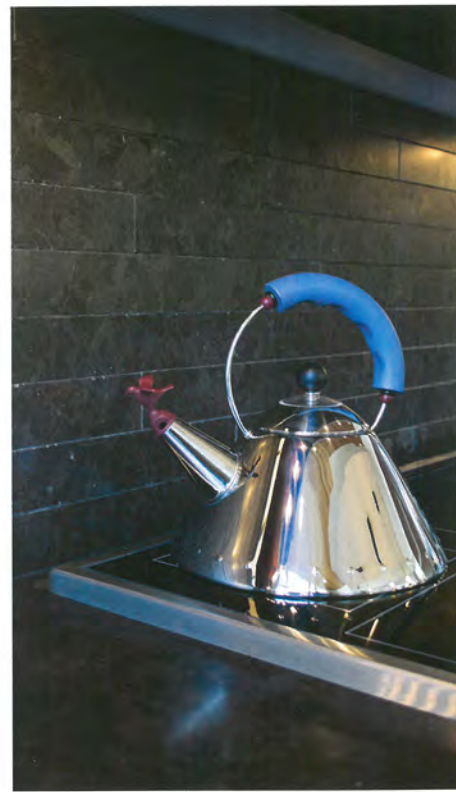
↑ The homeowners asked Granite-Tops granite company to create a cut a granite backsplash to complement the kitchen's honed granite countertops.