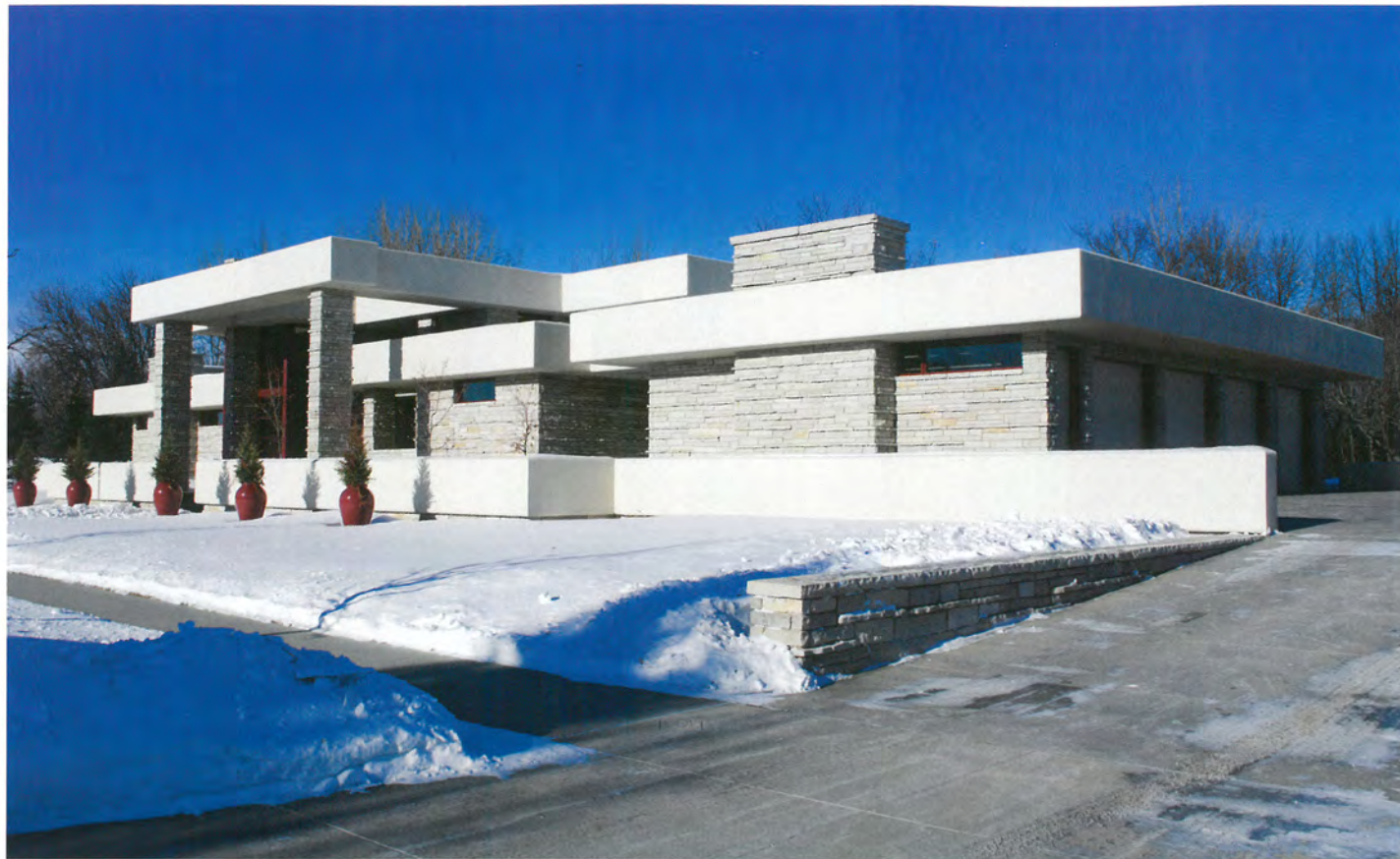
↑ Inspired by Frank Lloyd Wright's Falling Water House, this home features Dolomitic limestone columns with granite entryway steps and sidewalks. Flood protection panels and considerations were implemented to match and enhance the existing horizontal design.