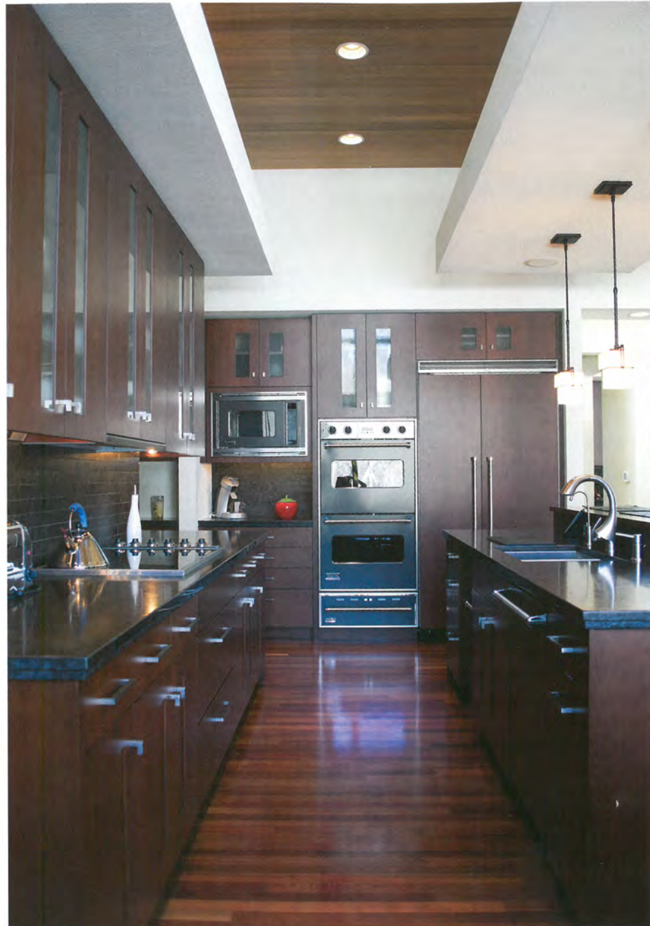
↑ A stunning kitchen features honed granite countertops and matching backsplash, a multilevel island, warm cherry cabinetry with glass inserts and brushed nickel hardware. High-end gray Viking appliances and a nearby breakfast nook complete this sensational space.

in harmony with the primary feature of our landscape," he explains. "The stone was chosen and laid in a manner that accentuates this theme."