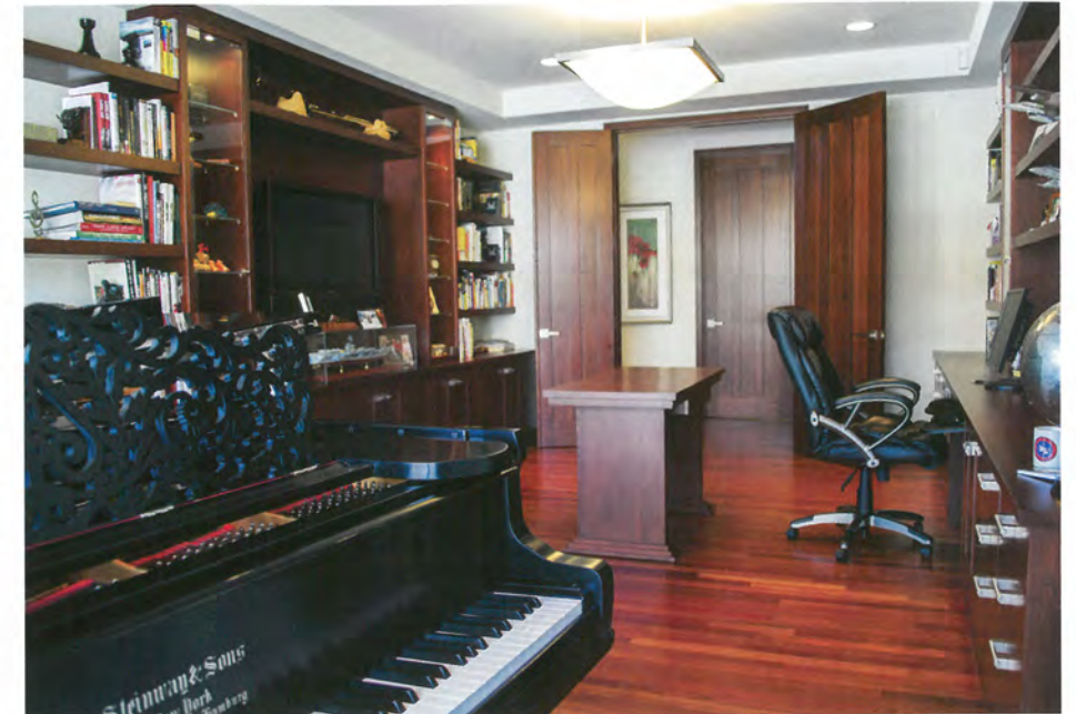
↑ Behind the fireplace is a den featuring solid cherry French doors, built-in cabinetry with glass shelving, a cherry desk and grand piano. Dramatic river views make this a fabulous office setting!

"We combined modern design with textures and the warmth of woodwork for a clean look," she concludes. "The home is an eclectic mix of mainly modern with a touch of antiques for interest." *