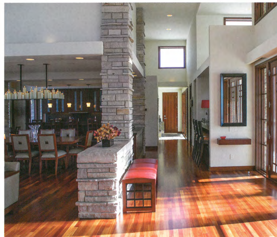
↑ A European-inspired textured glass door lends a grand entrance to incredible outdoor views from the home's entryway. Down the hallway, a central office, pantry, powder room, laundry room and four-stall garage are conveniently located.