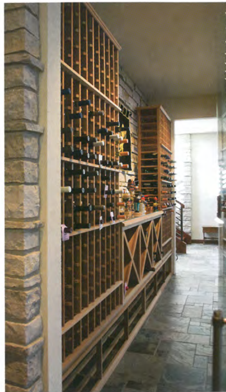
↑ Great for entertaining, the climate-controlled wine cellar – kept at precisely 65 degrees – in the unfinished cedar has an actual family crest displayed upon the wall.