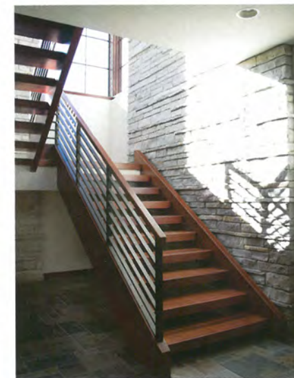
← An intricate-patterned, open-tread cherry stairway with bronze and cherry railing has abundant lighting and features electronically controlled light-blocking shades.