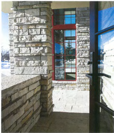
↑ An additional entrance is opened to show the magnificent Frank Lloyd Wright style of virtually seeing through many sections of the home to reveal the outdoors.