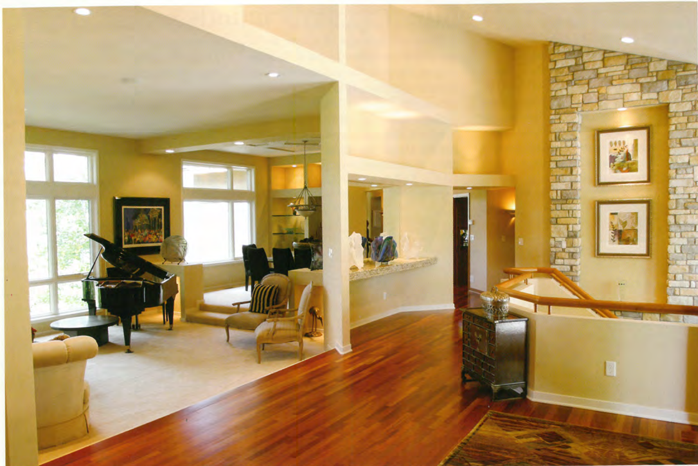
This open prairie-style home combines great detail with natural materials for a stunning effect.