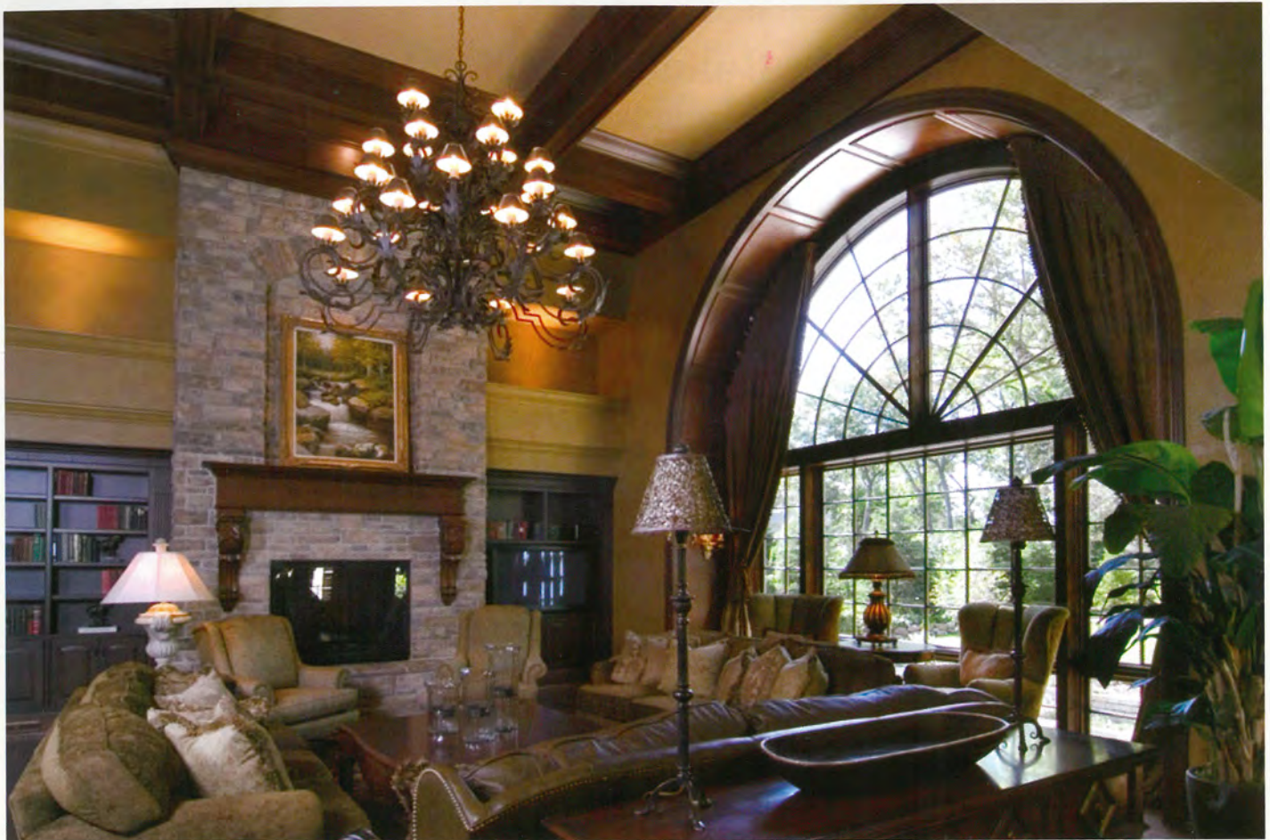
Spectacular arched windows and a stone floor-to-ceiling fireplace create a great room masterpiece.